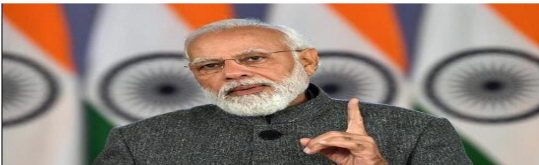
Narendra Modi

The Prime Minister said that more than one crore children have sent him their ‘mann ki baat’ not just from across the country but also from abroad as a part of the ongoing Azadi ka Amrut Mahotsava celebration.