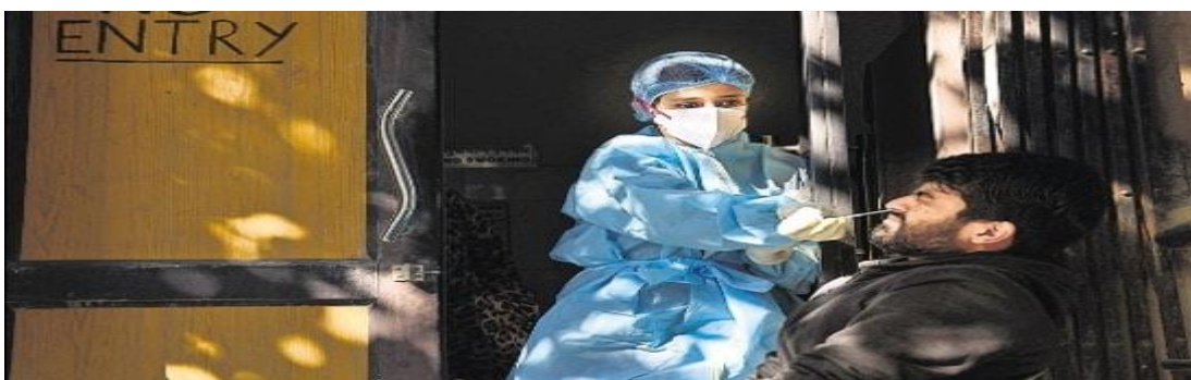
A man gets a Covid-19 test in Delhi. (Representational image)

The higher number of deaths reported in the fresh 24 hours is due to Kerala adding 374 backlog deaths to Monday's count.