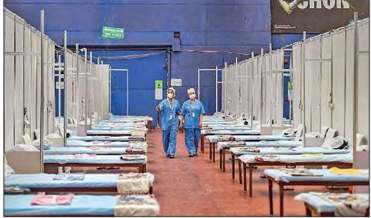
खेल गांव में 6 दिन में तैयार हुआ 500 बेड वाला कोविड सेंटर (विस)

बीते 24 घंटे में देश में कोरोना के कुल 22752 नए मामले सामने आए हैं। कुल मरीजों की संख्या अब 7 लाख 42 हजार 417 हो गई है। अबतक 4 लाख 56 हजार 831 लोग ठीक भी हो चुके हैं। देश में अबतक कुल 20,642 लोगों की मौत हो चुकी है। झारखंड के सीएम हेमंत सोरेन ने खुद को क्वारंटीन कर लिया है। ▶▶ पेज 12