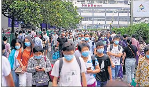
चीन के शंघाई रेलवे स्टेशन से बुधवार को बाहर आती भीड़। संक्रमण से बचने के लिए सबने मास्क लगा रखा था।